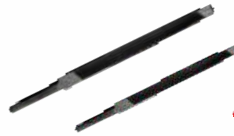
NHT 215 SLIM TAPER FILE FEATURES

Size: 200/250mm Finish: Self / Blackened Available in single piece pouch packing