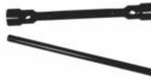
NHTS 103 WHEEL SPANNER WITH TOMMY BAR

FEATURES Size: 14" x 16 mm Punch Size: 17 x 19 x 21 x 23,24,1/2" Finish: BCP / ZP / PC