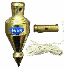
NHT 212 PLUMB BOB CONICAL