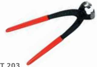
NHT 203 CARPENTER PINCER

Size: 8"/10"/12"/14"/18"/24"/36"/48" Finish: PC / Polished Jaws