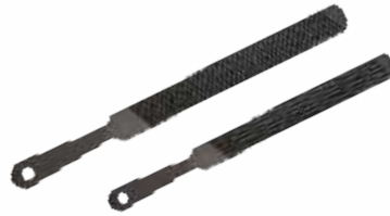
NHT 214 FARMER'S OWN FILE FEATURES

Size: 200/250mm Finish: Self / Blackened Available in single piece pouch packing