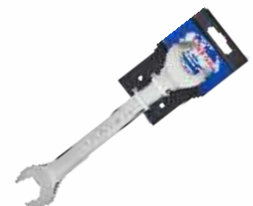
COMBINATION SPANNER SINGLE PC. PACKING