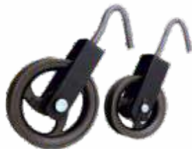
NHT 219 WELL PULLEY FEATURES