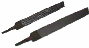
NHT 213 MILL BASTARD FILE FEATURES

Size: 200/250mm Finish: Self / Blackened Available in single piece pouch packing