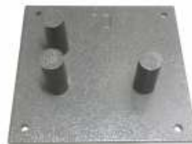
NHT 220 BAR BENDING PLATE FEATURES