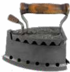
NHT 216 CHARCOL IRON FEATURES

Size: 200/250mm Finish: Self / Blackened Available in pouch/blister packing