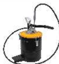
NHT 223 GREASE BUCKET FEATURES

Size: 3 Ltr without wheels 5 Ltr with & without wheels 10/15/20 Ltr with wheels Finish: PC