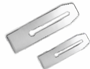
NHT 218 JACK PLANE IRON BLADE FEATURES

Size: 4/5 No. Finish: BCP / Plastic Handle Accessories: Brass