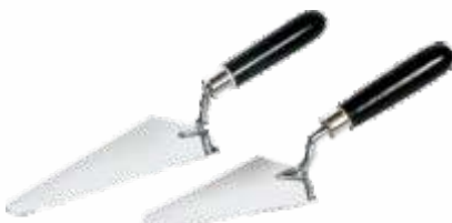
NHT 222 TROWEL FEATURES