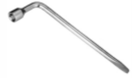
NHTS 104 L TYPE SPANNER WITH TYRE LEVER

FEATURES Spanner Size: 26 x 400 mm Tommy Bar Size: 19 x 400 mm Finish: BCP / ZP / PC