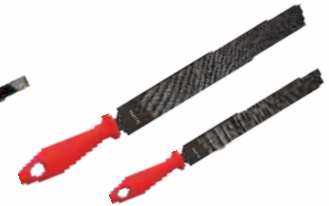
NHT 226 FILE - FIBRE HANDLE FEATURES

Size: 100/125mm Finish: Self / Blackened Available in skin card packing