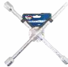
NHTS 102 CROSS WHEEL SPANNER REINFORCED

FEATURES Size: 14" x 14 mm Punch Size: 17 x 19 x 21 x 23,24,1/2" Finish: BCP / ZP / PC