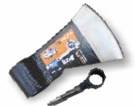
NHT 225 AXE

Size: 2-20 LBS Finish: PC / Polished Head Available with & without handle