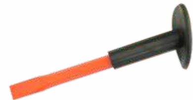
NHT 221 COLD CHISEL WITH GRIP FEATURES