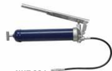
NHT 224 GREASE GUN FEATURES

Size: 3 Ltr without wheels 5 Ltr with & without wheels 10/15/20 Ltr with wheels Finish: PC