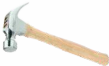
NHT 207 CLAW HAMMER

Size: 115/225/345/450/675/900/1120 gm Finish: ZP Available with & without Wooden Handle