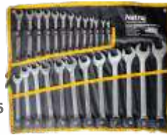
NHTS 116 WITH POUCH PACKING

FEATURES Size: Set of 12Pcs / 14 Pcs Finish: Mirror