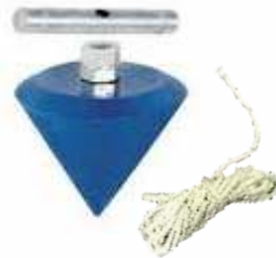
NHT 211 PLUMB BOB AFRICAN