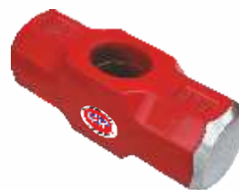
NHT 209 SLEDGE HAMMER

Size: 2/2.5/3 LBS Finish: PC Available with & without handle