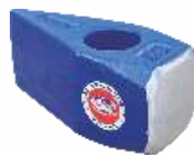
NHT 208 MASON HAMMER

Size: 225/345/450/675/900/1120 gm Finish: BZP Available with & without handle