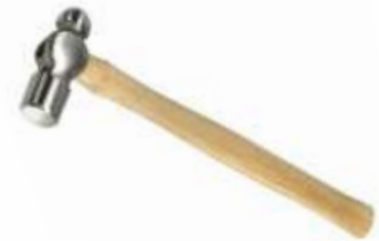
NHT 206 BALL PIN HAMMER