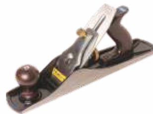
NHT 217 SMOOTH JACK PLANE FEATURES

Size: 4/5 No. Finish: BCP / Plastic Handle Accessories: Brass