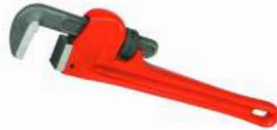
NHT 202 PIPE WRENCH

Size: 3"/4"/5"/6"/8" Finish: PC / Polished Jaws