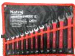
NHTS 115 WITH RUBBER GRIP

FEATURES Size: 6-32 mm Finish: Matt Available in sets in pouch pack & plastic rack