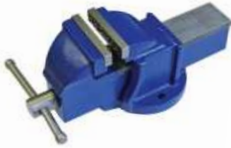
NHT 201 BENCH VICE