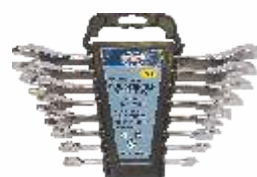
DOE SPANNER TRAY PACKING

FEATURES Size: Set of 8/12/14/25 Pcs. Finish: Mirror / Satin / Full Polish