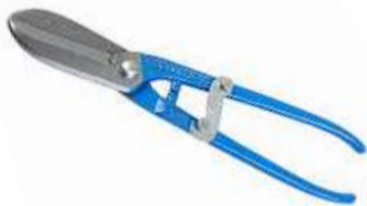
NHT 204 TINMAN SNIP

Size: 100/200/300/400/500/600 gm Finish: BCP /PC