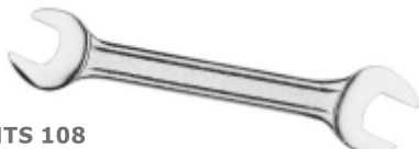
NHTS 108 DOUBLE OPEN END SPANNER CARBON STEEL

FEATURES Size: 6x7-30x32 mm Finish: Satin Available in sets in pouch pack & plastic rack