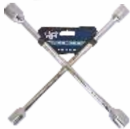
NHTS 101 CROSS WHEEL SPANNER

FEATURES Size: 14" x 14 mm Punch Size: 17 x 19 x 21 x 23,24,1/2" Finish: BCP / ZP / PC