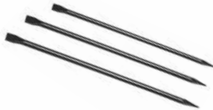
NHT 205 CROW BAR

Size: 6"/7"/8" Finish: PC / Polished Jaws With & Without Insulation Grip